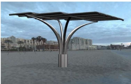
Figure 1: Hurricane-resistant solar panel structure designed by Terrasol Geosolar Inc.

Terrasol's solar canopy is engineered to withstand Category 5 hurricane winds and remains electrically sound after being completely submersed during storm surge floods. Made from carbon fibre, which is non-corrosive unlike aluminum or steel, the product has 20 years of life expectancy and conforms to the American Society of Civil Engineers' (ASCE) standards.